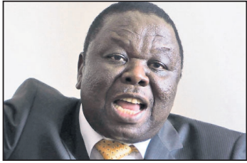
Zimbabwean Prime Minister Morgan Tsvangirai

24 HOUR BUSINESS NEWS & INFORMATION dorsetbusiness.co.uk